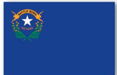
Nevada State Flag